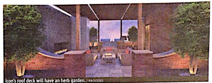
Icon's roof deck will have an herb garden.